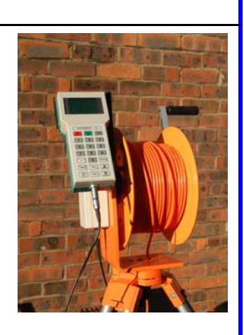
Winch with Datamat 5

Lower probe to bottom of the hole, then retrieve taking measurements at pre-selected intervals (2, 3, 5m etc.) depth intervals. A typical 15m hole can be surveyed in less than 2 minutes.